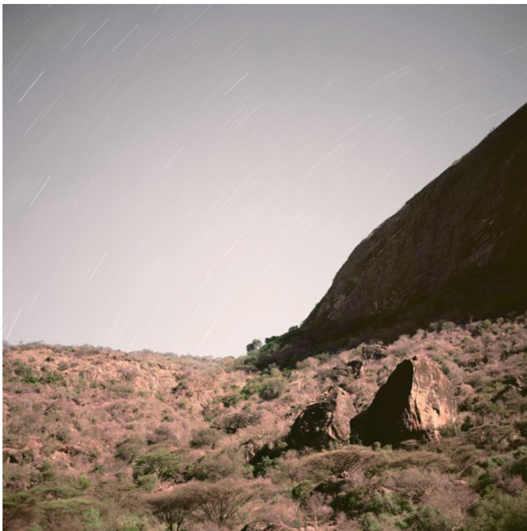
Fullmoon@Serpent Rock, 2017