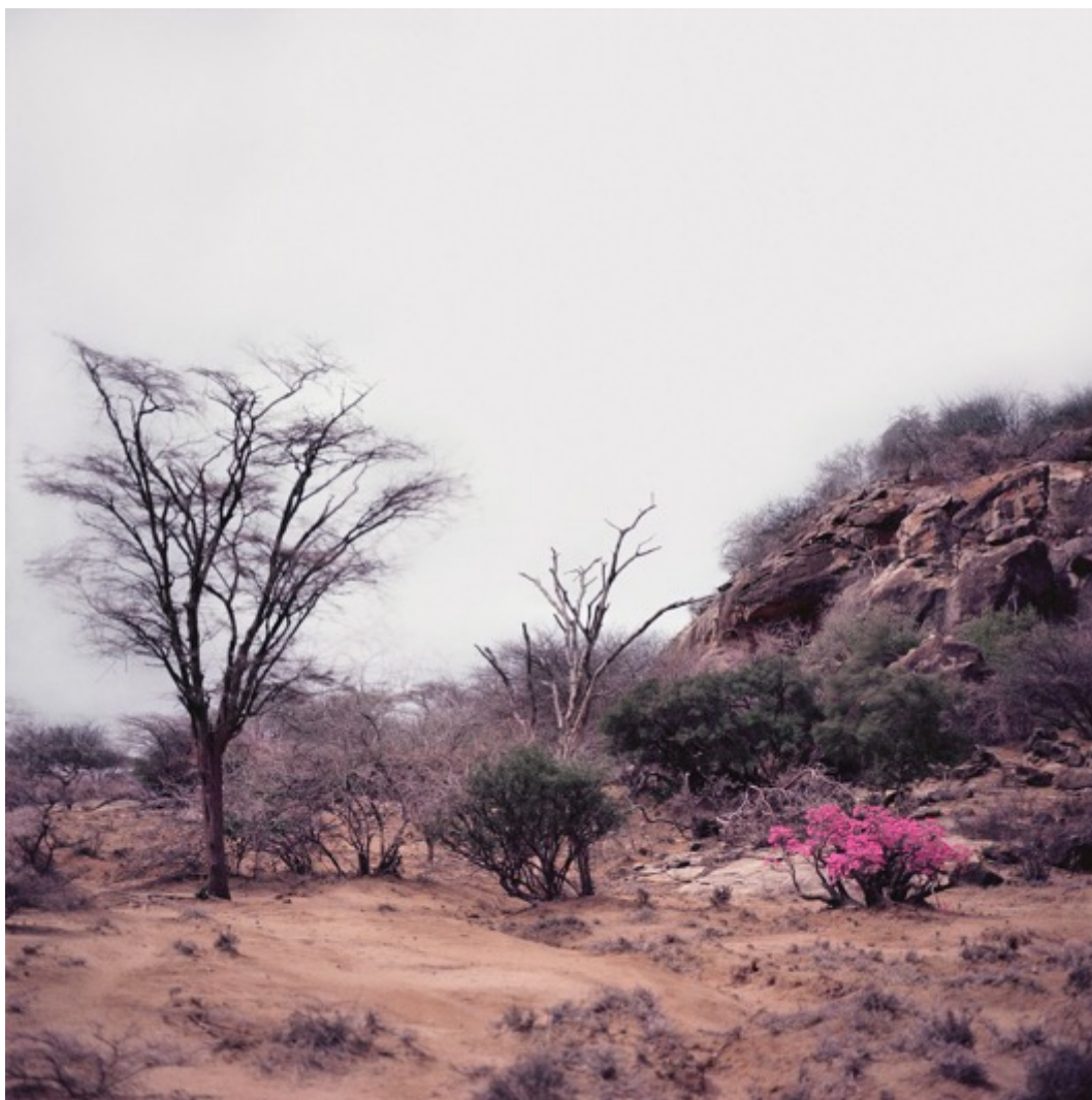
Fullmoon@Desert Rose, 2017