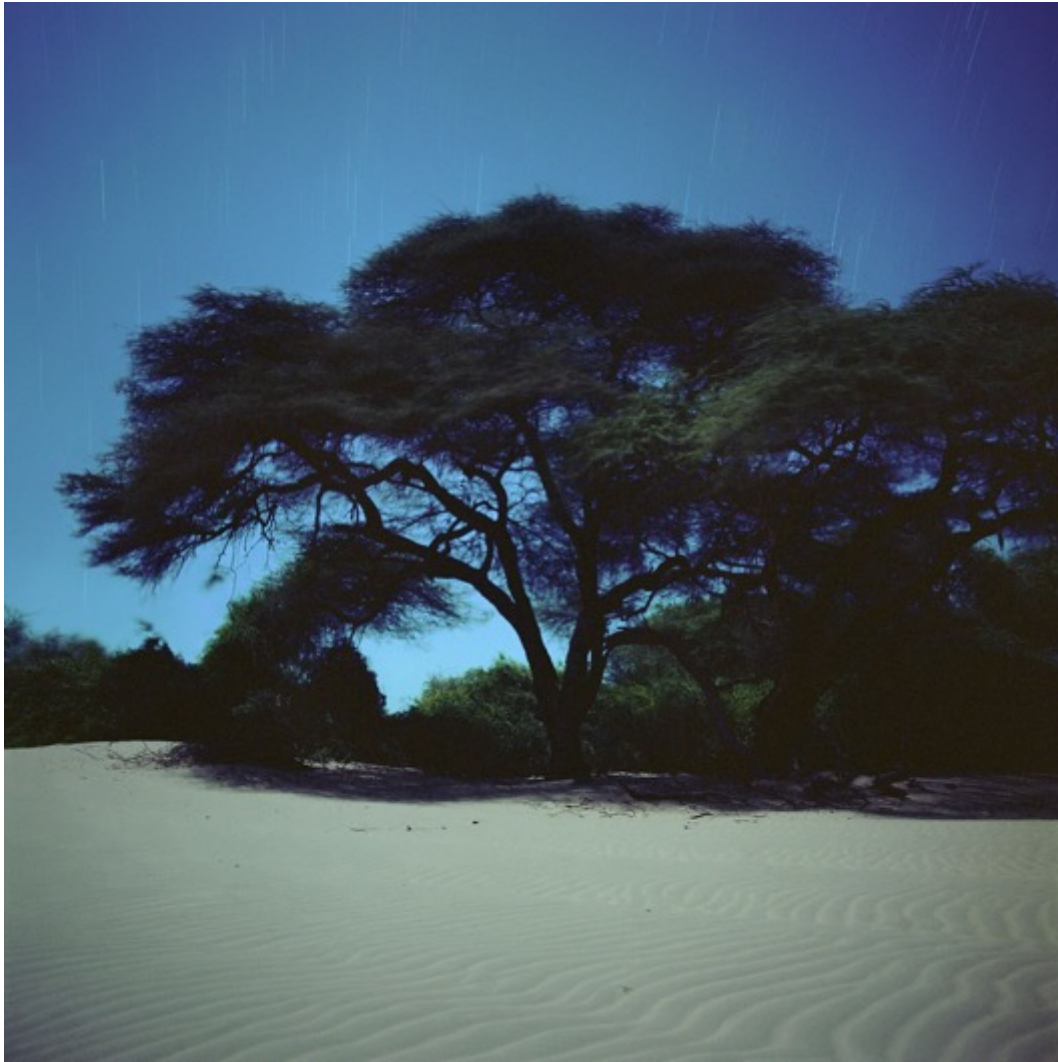
Fullmoon@Milgis Shadow, 2017