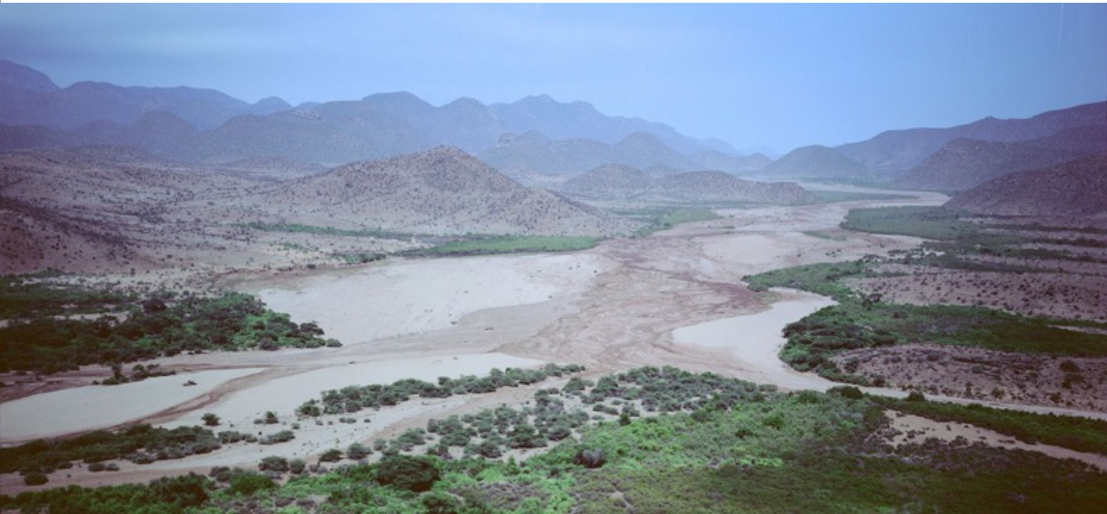
Fullmoon@Milgis Lugga, 2017